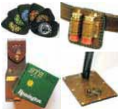
Accessories Blenders, Magnet Pads, Clips, and more!