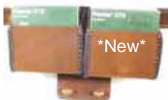
Double Shell Pouches Clips on Belt