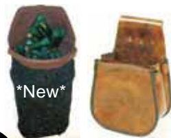
Mesh & Leather Empty Pouches

NEW Club-Team Program Special pricing with minimum order Call for details