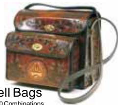
Shell Bags Over 80 Combinations