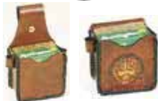
Single Shell Pouches Over 30 Combinations