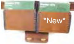
Double Shell Pouches Clips on Belt