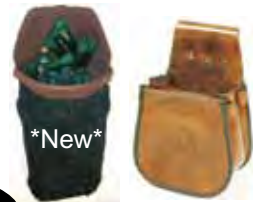
Mesh & Leather Empty Pouches

NEW Club-Team Program Special pricing with minimum order Call for details.