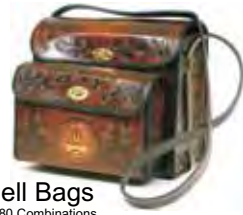
Shell Bags Over 80 Combinations