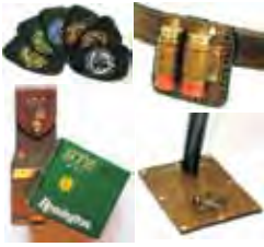
Accessories Blinders, Magnet Pads, Clips, and more!