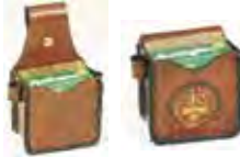
Single Shell Pouches Over 30 Combinations