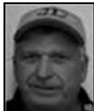
Ed Hammond Central